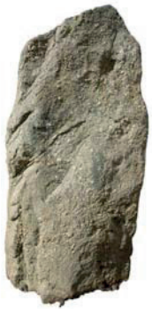
La Pedra Llarga → Palau-solità i Plegamans