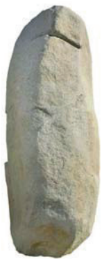
La Pedra Serrada → Parets del Vallès