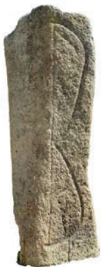
Menhir de Castellruf → Santa Maria de Martorelles