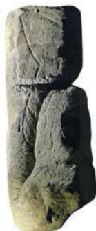
La Pedra de Llinàs → Montmeló